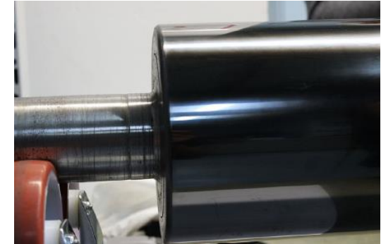
Hybrid Chrome replacement (HCR) DLC Technology