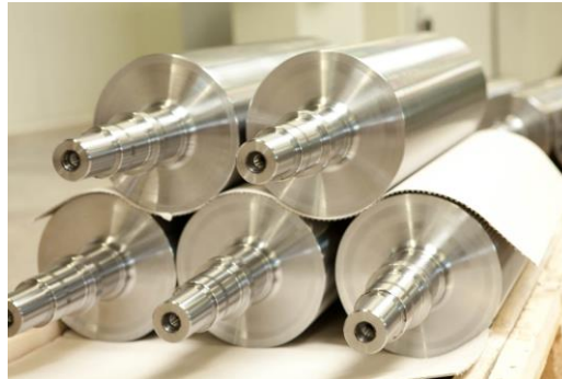
Chrome III Cronos 2024