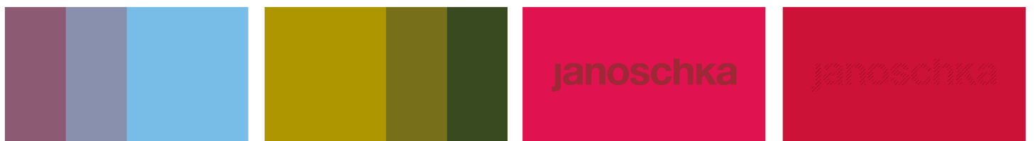
Pearl gloss ink